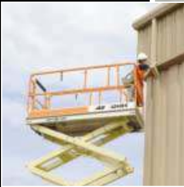
CE Rated for Indoor/Outdoor Usage