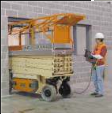
Compact Size and Narrow Widths For Ease of Access