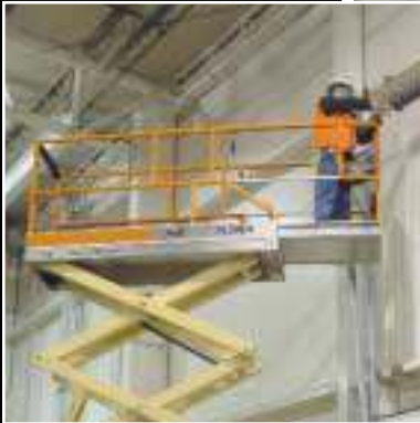
Larger Platforms and Higher Capacities